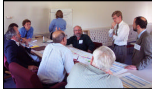
Members of the municipalities broke out into groups to discuss their thoughts and gain a better understanding of the growth in the surrounding townships.

Conference participants learned about Lancaster County population and employment projections for the 30-year period of 2000 - 2030 and considered projections of additional land that might be developed to house and provide employment locations for these new residents and employees.